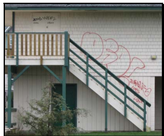
Freshly painted washroom building tagged at Anderton Park

... that waste paper is such an important part of the paper-making process now, that Canadian mills are importing it from the US ( www.axys.net/ ).