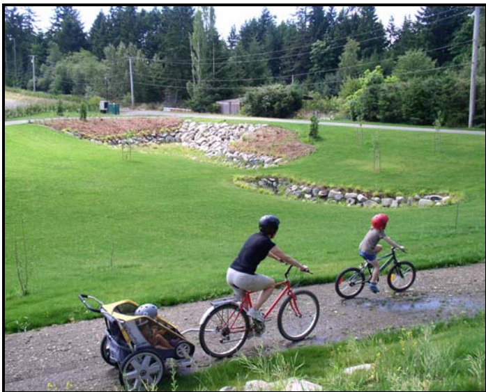
New detention pond and trail at McDonald Road/Noel Avenue

This section of greenway is 250 metres long and 2.5 metres wide, and will be lined with trees along the Lancaster Park section. Park benches, garbage cans and Doggie Bag Stations will be added along the route as well.