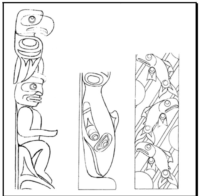
Some of the images from the new totem

The totem will be erected as the focal point of the newly constructed Knight Road traffic circle.