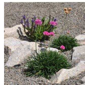
New rock garden at Recreation Centre

We are still able to install water meters. If you would like to have one installed, please contact Town Hall at 250 339-2202. For more information on our water system please go to http://comox.ca/water .