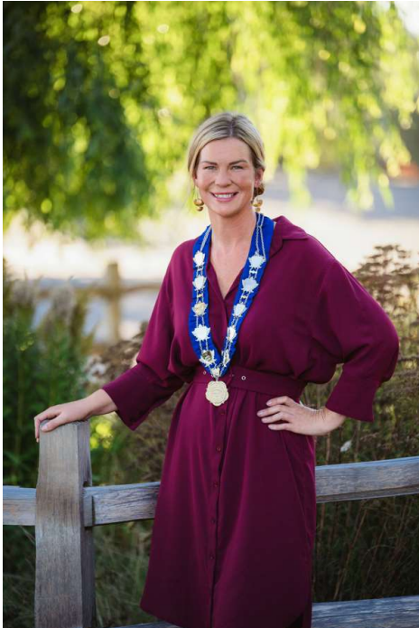
Nicole Minions Mayor

As your Mayor, I am pleased to present our updated strategic plan, a roadmap that outlines our commitment to you and the future of our community and Town of Comox.